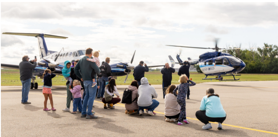
Sanford Plane & Helicopter