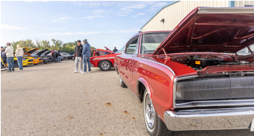
Cars and Coffee Car Show