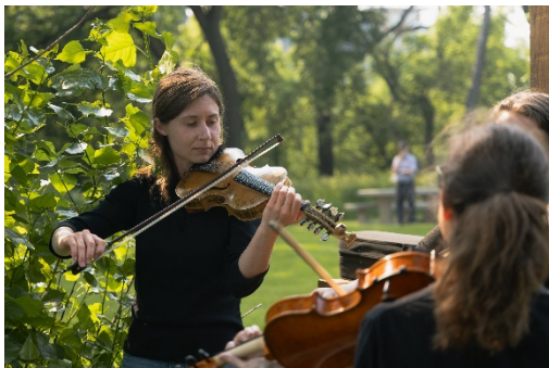
○ June 25 th RiverArts