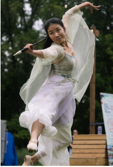
August 6 th – Front Fenders + Heather & Thistle Pipes and Drums